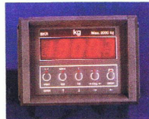
Black box with display 2000-C

Notice : Regarding calibration ,Mechanic up to 100T / Electronic up to 120T. IP67